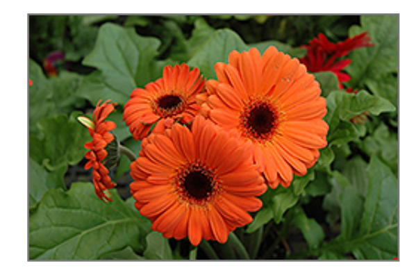
Orange Gerbera Daisy flowers

Orange Gerbera Daisy is recommended for the following landscape applications;