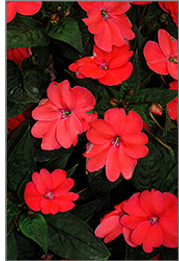
SunPatens Compact Coral New Guinea Impatiens flowers