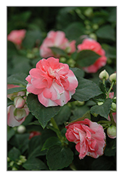
Fiesta Sparkler Salmon Double Impatiens flowers

Shade tolerant with excellent branching and uniformity, this series presents large, brightly colored, double blooms resembling roses; self-cleaning, no deadheading needed; an outstanding choice for garden landscapes and containers