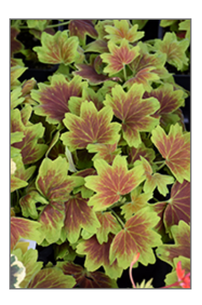
Vancouver Centennial Geranium foliage