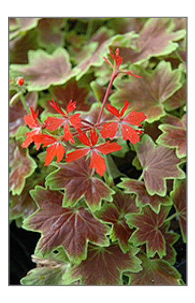
Vancouver Centennial Geranium flowers