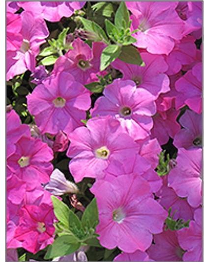
Easy Wave Pink Petunia flowers

Easy Wave Pink Petunia is a dense herbaceous annual with a trailing habit of growth, eventually spilling over the edges of hanging baskets and containers. Its medium texture blends into the garden, but can always be balanced by a couple of finer or coarser plants for an effective composition.