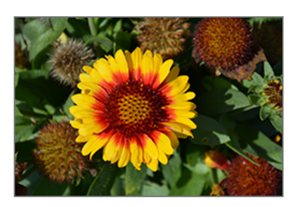
Mesa Bright Bicolor Blanket Flower flowers