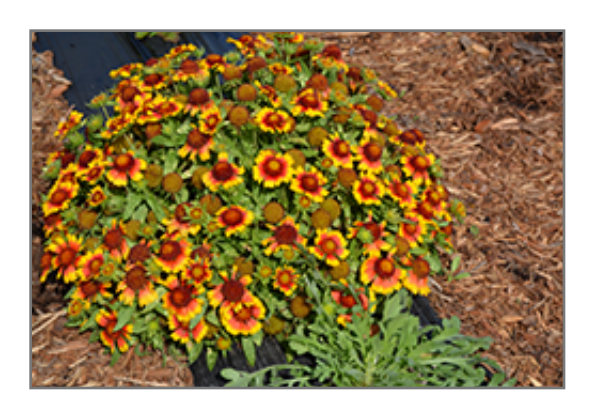
Mesa Bright Bicolor Blanket Flower in bloom