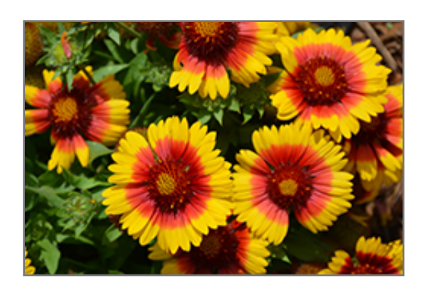
Mesa Bright Bicolor Blanket Flower flowers

Mesa Bright Bicolor Blanket Flower is a dense herbaceous perennial with a mounded form. Its relatively fine texture sets it apart from other garden plants with less refined foliage.