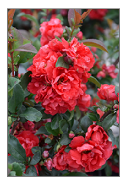
Double Take Pink Flowering Quince flowers