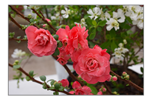
Double Take Pink Flowering Quince flowers

Double Take Pink Flowering Quince is a dense multi-stemmed deciduous shrub with a more or less rounded form. Its average texture blends into the landscape, but can be balanced by one or two finer or coarser trees or shrubs for an effective composition.