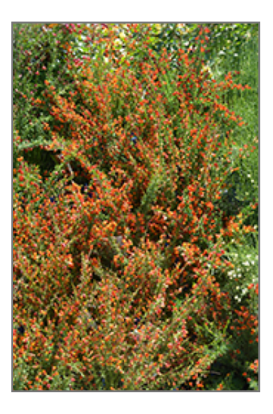
Lena Scotch Broom in bloom