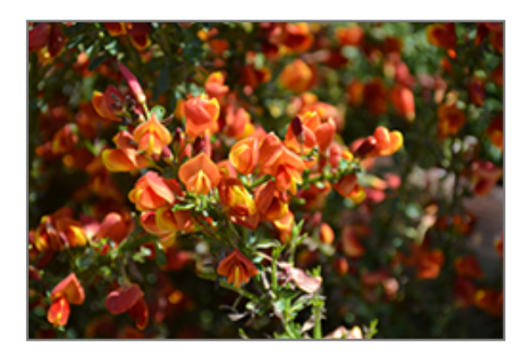
Lena Scotch Broom flowers