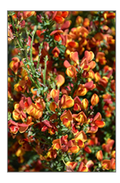
Lena Scotch Broom flowers